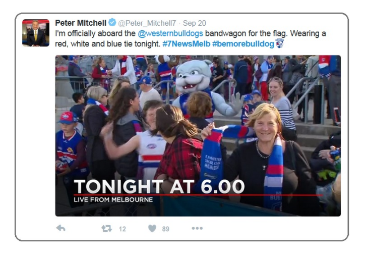
Figure 1: Example of a tweet message containing a mention (@westernbulldogs), two hashtags (#7News-Melb and #bemorebulldog) and an attached picture.

Determining the location of a social media user and where a message is posted from is important for location-based recommendation (Ye et al., 2010), crisis detection and management (Sakaki et al., 2010), detecting location-centric communities (Lim et al., 2015), demographics analysis (Sloan et al., 2013) and targeted advertising (Tuten, 2008). This work aims to assign a geographical location (most probable location from a list of pre-defined locations, such as cities or countries) to a piece of text. For this textual content, we focus on the Twitter social networking site, which boosts more than 500 million tweets posted on a daily basis (Internet Live Statistics, 2016). In Twitter, tweets are short messages of 140 characters or less, and can also include #hashtags to indicate the topic of the tweet and @mentions to refer to another user. Fig. 1 shows an example of a tweet that contains a text message with a mention of @westernbulldogs, two hashtags of #7NewsMelb and #bemorebulldog, along with an embedded image.