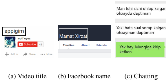
Figure 1: Examples of UULA cases from social media.

UULA restoration techniques are critical to process non-standard Uyghur text and develop a new type of input method editor (IME) that automatically suggests correctly written words and thus reduce the amount of UULA text. Figure 1 and Table 3 show several real examples of the increasing amount of UULA text on social media and the Internet. In this study we aim to 1) process and standardize the UULA text on the web so that it can be used for other NLP tasks such as information retrieval 2) help to create IMEs equipped with UULA restoration techniques that will prevent the generation of more non-standard text. Furthermore, although UULA restoration is a problem specific to the Uyghur language, the result will be useful for other character-level normalization problems and may be used for languages with similar mapping issues.