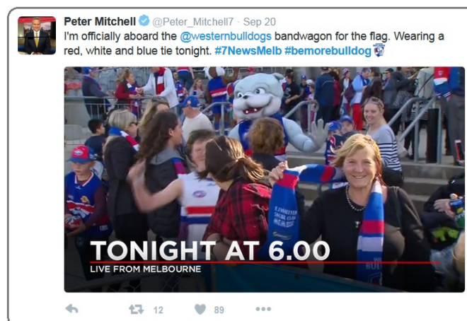
Figure 1: Example of a tweet message containing a mention (@westernbulldogs), two hashtags (#7NewsMelb and #bemorebulldog) and an attached picture.

Determining the location of a social media user and where a message is posted from is important for location-based recommendation (Ye et al., 2010), crisis detection and management (Sakaki et al., 2010), detecting location-centric communities (Lim et al., 2015), demographics analysis (Sloan et al., 2013) and targeted advertising (Tuten, 2008). This work aims to assign a geographical location (most probable location from a list of pre-defined locations, such as cities or countries) to a piece of text. For this textual content, we focus on the Twitter social networking site, which boasts more than 500 million tweets posted on a daily basis (Internet Live Statistics, 2016). In Twitter, tweets are short messages of 140 characters or less, and can also include #hashtags to indicate the topic of the tweet and @mentions to refer to another user. Fig. 1 shows an example of a tweet that contains a text message with a mention of @westernbulldogs, two hashtags of #7NewsMelb and #bemorebulldog, along with an embedded image.